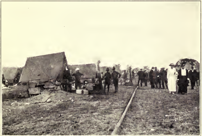
REGIMENTAL STREET AND COOK-SHACKS AT FRAMINGHAM